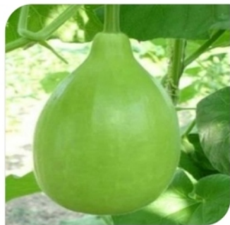
AZBG-53 (BABU GOSHA)

Lattu type fruits fruit weight 350-450 g. Tender flesh, High yielding